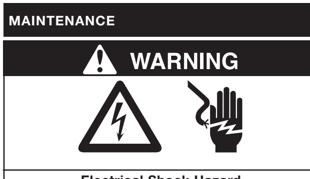
Electrical Shock Hazard

If motor fails to start or slows down significantly under load, shut off and disconnect from power supply. Check that the voltage is correct for motor and that motor is turning in the proper direction. If unit is extemely cold, let it wrm up to room temperature before starting. Vane life will be drastically reduced if motor is not operating properly. Vanes can break or be damaged if motor/pump runs in the wrong direction.