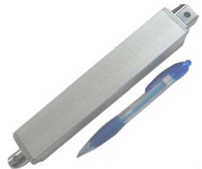
Mini-actuator as compared to pen

Controlled Motion Dynamics met the customer's specific requirements by designing an 80/20 slide assembly. The assembly was easily bolted into the customer's existing framework. Mounting the small actuator to the 80/20 slide, Controlled Motion Dynamics also built the custom RS232 interface. Prior to shipping, CMDI fully constructed and tested the actuator. After the customer installed and tested the actuator it was so pleased that fifteen additional actuators were ordered.