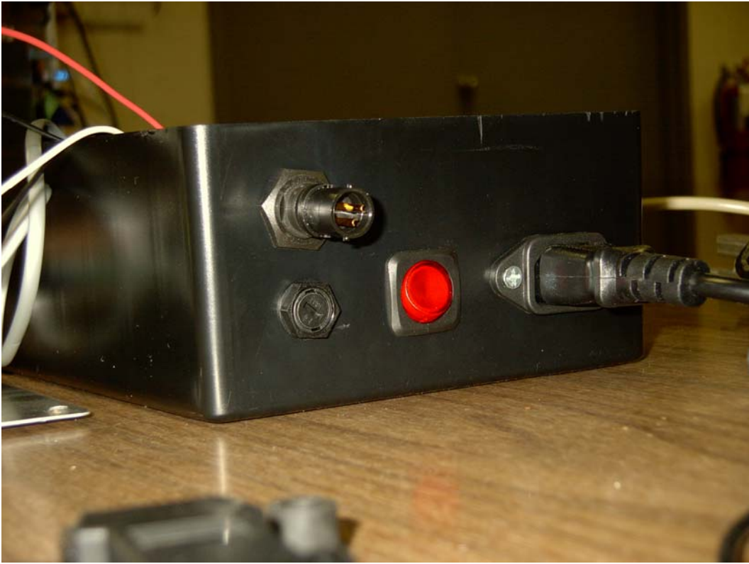
120 vac and actuator connection